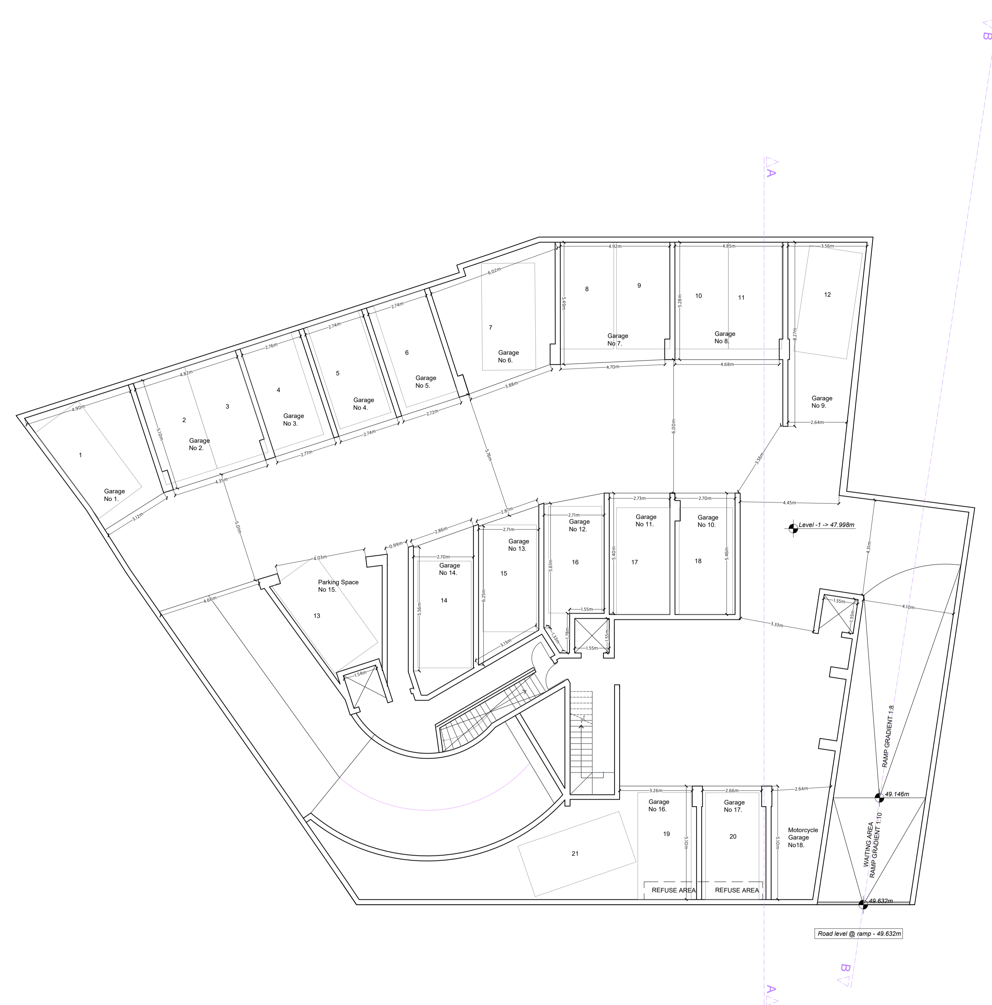
Proposed Level -1 Scale 1:100